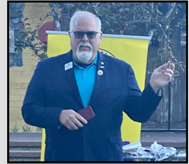
VDG Clayton in Service, Visitations and Convention