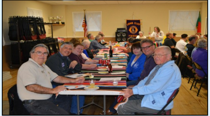
San Bruno, Burlingame, BASO Lions