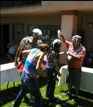
got their outgoing President, Membership Chair, and nearby members hazed, too.