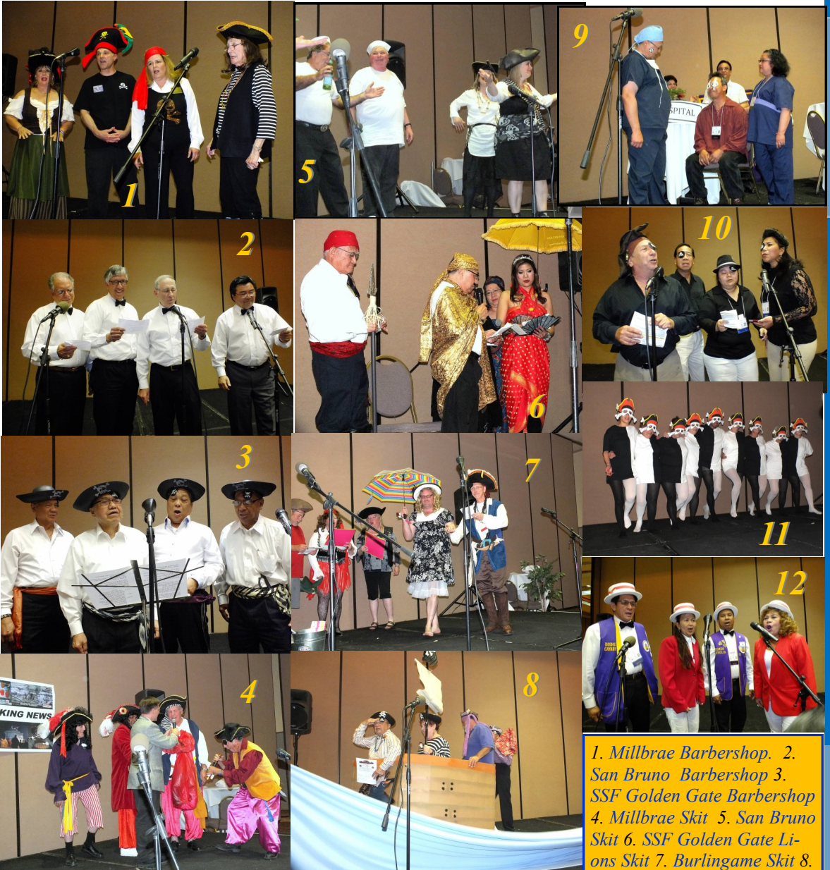
1. Millbrae Barbershop. 2. San Bruno Barbershop 3. SSF Golden Gate Barbershop 4. Millbrae Skit 5. San Bruno Skit 6. SSF Golden Gate Lions Skit 7. Burlingame Skit 8. San Carlos Skit 9. SF Host Skit

More photos can be found at lionmichaelchan.shutterfly.com 10. Foster City Barbershop 11. BASO Lions Skit 12. SF Host Barbershop