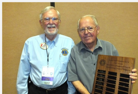
Burlingame Lions win Bulletin Contest Perpetual Award for Outstanding Bulletin

"To Protect and To Serve" thru Proven Leadership, Experience and Personal Integrity