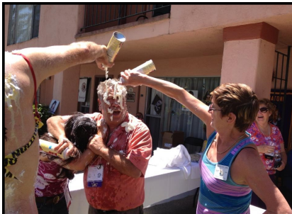
San Bruno and Foster City Lions hazing their incoming Presidents. Foster City