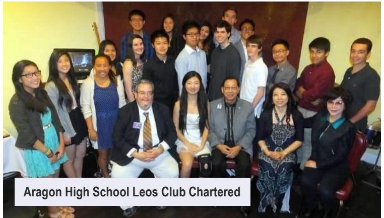
Aragon High School Leos Club Chartered

We're in the "Home Stretch", so let's work hard to retain our outstanding Lions in each of our clubs and at the same time work hard to increase the membership in each of our clubs, especially the 8 clubs that have zero growth or the 17 clubs that have experienced negative growth for the year. Remember, it's the responsibility of EVERY lion in every club to help retain current members and grow your clubs. Thank you for all that you do and God bless you for your commitment to serve those who need our help and assistance. As a Lions Club Member you make a significant difference in the lives of those in our communities, our district, our nation and our world. Never forget that you have the power to change the world for the betterment of mankind; rise to the occasion and remember to NEVER GIVE UP!