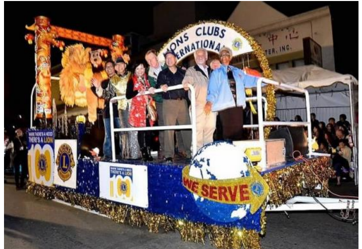
Lions Chinese New Year's Parade Float 2015