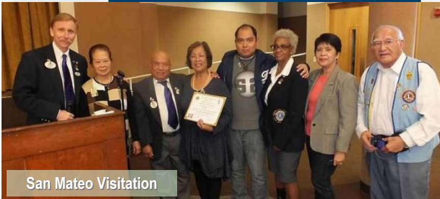
San Mateo Visitation