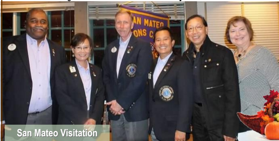
San Mateo Visitation