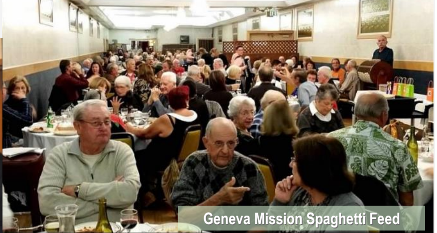
Geneva Mission Spaghetti Feed