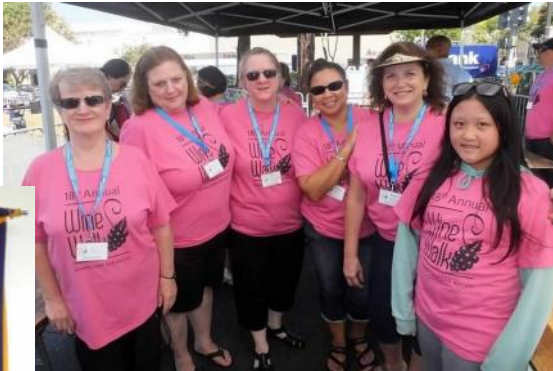
San Mateo Lions Volunteer at the Downtown Wine Walk

We Serve - San Francisco to Palo Alto September 2014