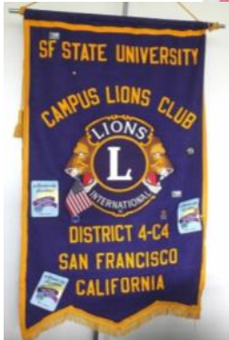
Welcome SF State University Campus Lions Club!