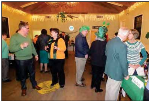
Burlingame Lions St. Patrick's Day Dinner