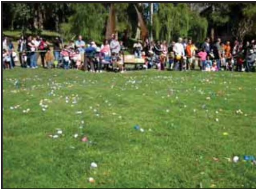
March 23 San Bruno Lions Club Easter Egg hunt and Pancake Breakfast