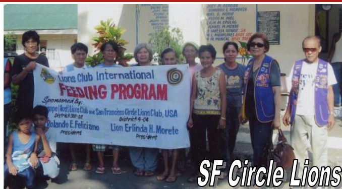
SF Circle Lions

The San Francisco Circle Lions Club was chartered on March 25, 2006. It is based at the outer Mission Area of the city of San Francisco. The club has three on-going major projects which have been conducted in the