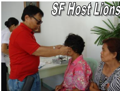
SF Host Lions

San Francisco Host is a member of the Lions Eye Foundation and the Lions-In-Sight. The Club's major yearly project is a Medical Mission to the Philippines. On the home front, the following projects are: Health Fairs, Feeding the Homeless, Peace Poster Contest, Flag Day, Collecting Used Eyeglasses, Recycling and Serving Seniors in different capacities. The Club's major fundraiser is the LYCA and the annual dinner dance. As of March, 2010 they have 39 members, 5 of which are life members, 16 Melvin Jones Fellows & 5 Progressive, 1 Progressive Helen Keller, and 4 Lions Eye Foundation Life Members.