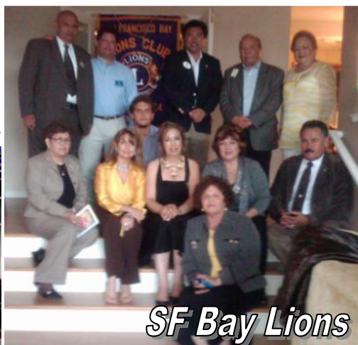
SF Bay Lions

from among themselves, in order to give back to society. They are eager to participate in