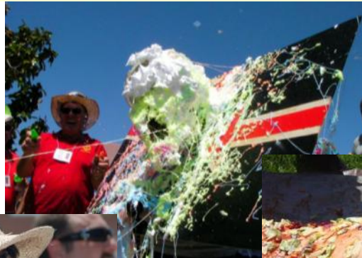
A rite of passage – the initiation of a President