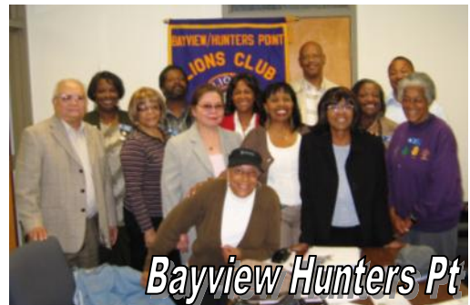
Bayview Hunters Pt

The Club has also held a black history program at their adopted middle school, Visitation Valley Middle School. They have been sponsors of the Annual Juneteenth Festival, established on June 19, 1865, the day that slaves were freed in Texas. Bay View Lions have been in the annual parade, where they have set up an informational booth in order to recruit potential members during the festival.