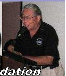
Reports from Clubs & Lions Eye Foundation