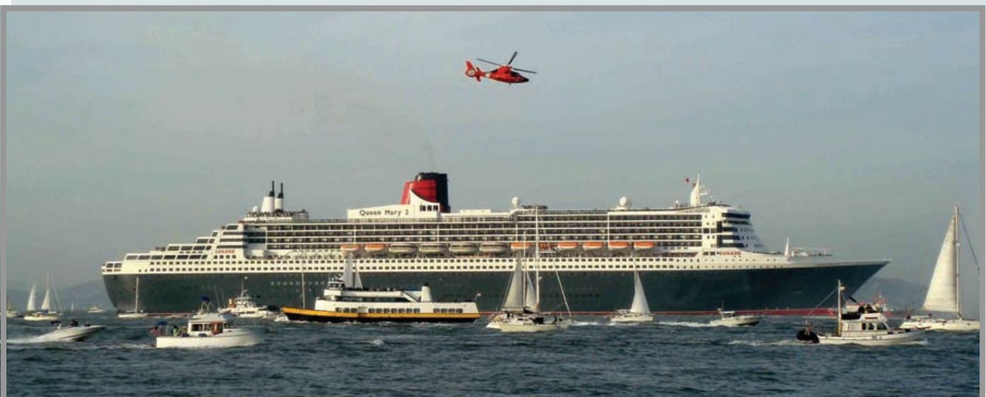
Queen Mary II sailing into San Francisco Bay