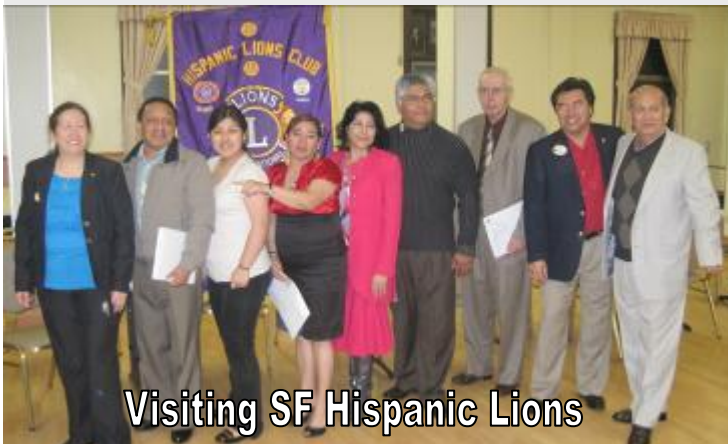
Visiting SF Hispanic Lions