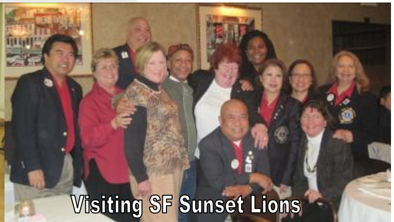
Visiting SF Sunset Lions