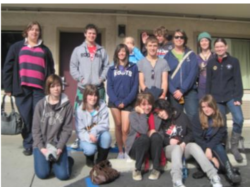
Australia Youth Exchange Students Visit