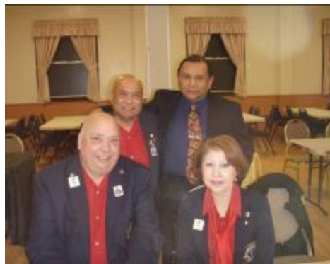
Above: Visitations with SF Park Gate & SF Circle Lions