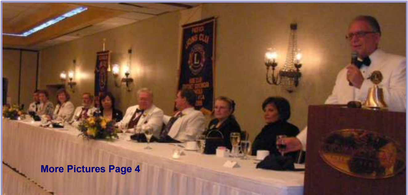
More Pictures Page 4