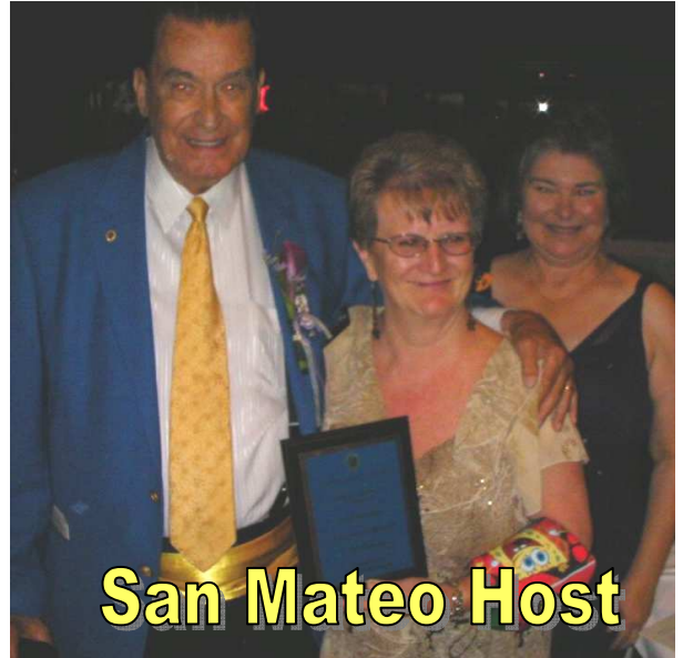
San Mateo Host