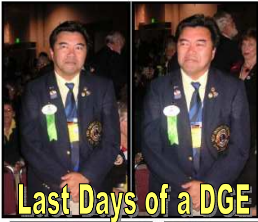
Last Days of a DGE