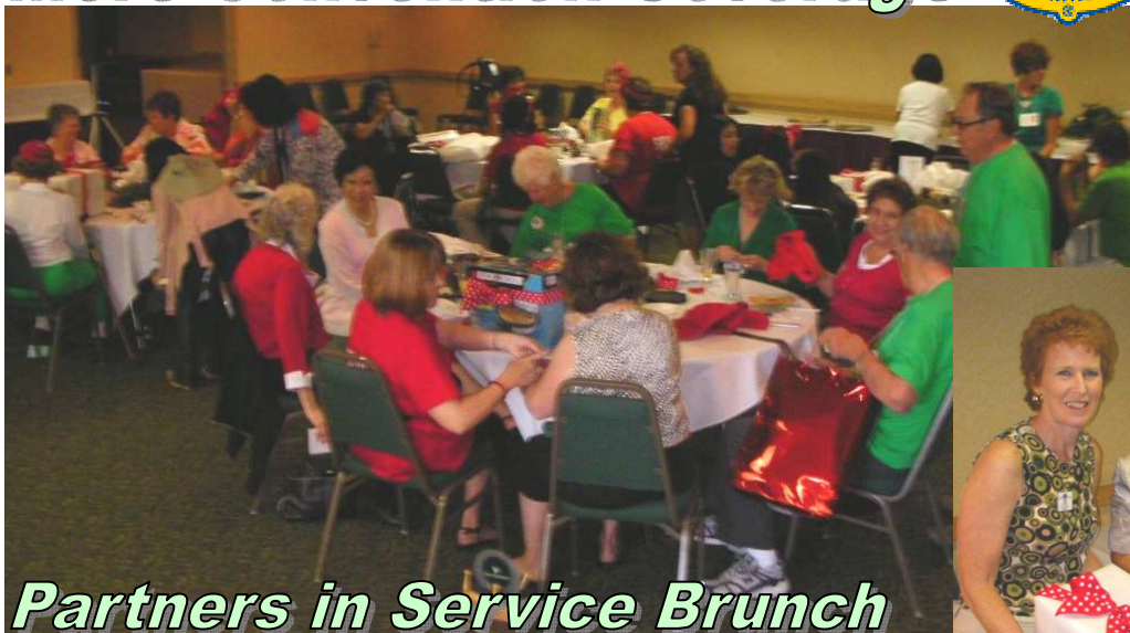
Partners in Service Brunch