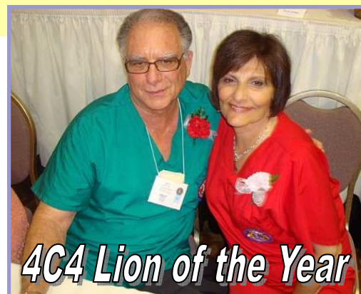
4C4 Lion of the Year