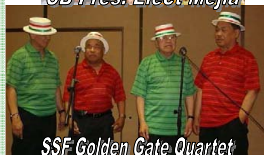
SSF Golden Gate Quartet