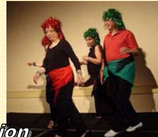
More Pictures from the Convention