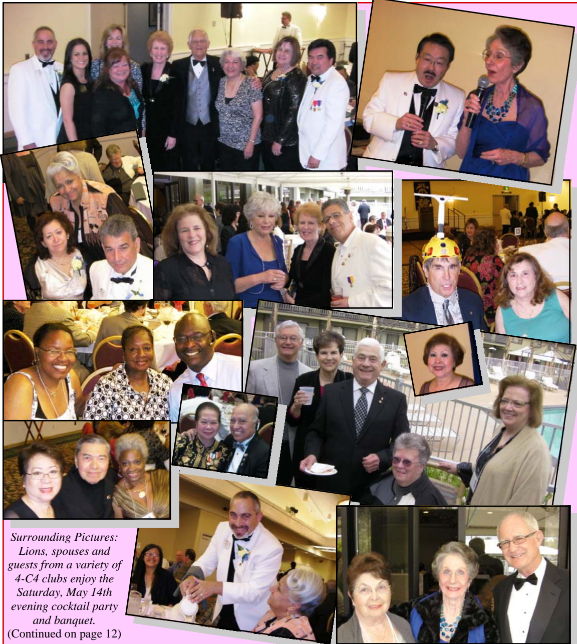
Surrounding Pictures: Lions, spouses and guests from a variety of 4-C4 clubs enjoy the Saturday, May 14th evening cocktail party and banquet. (Continued on page 12)