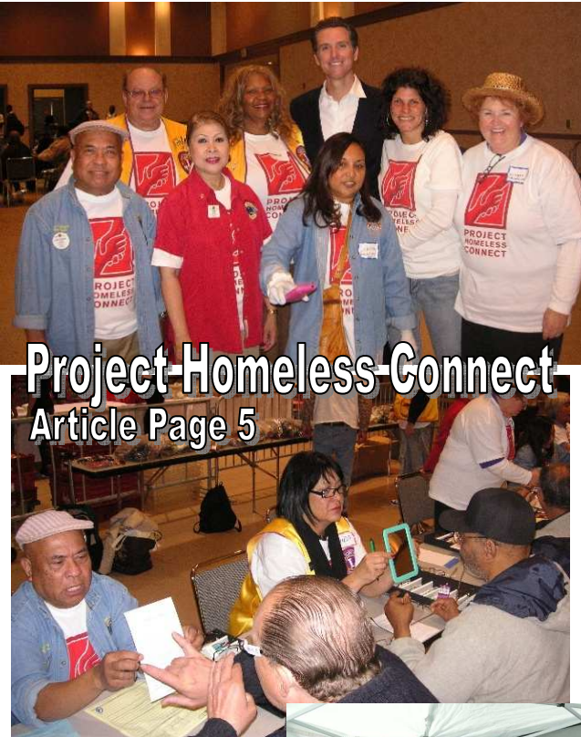
Project Homeless Connect Article Page 5

We Serve - San Francisco to Palo Alto - October 2009