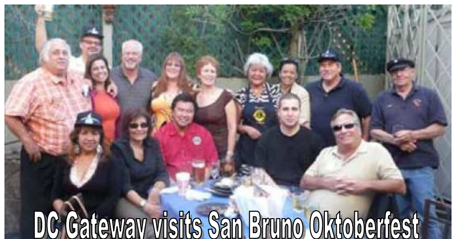
DC Gateway visits San Bruno Oktoberfest