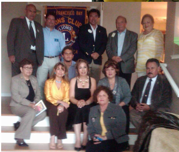
SF Bay Installation