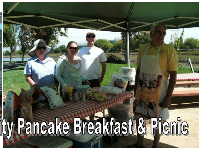
Redwood City Pancake Breakfast & Picnic