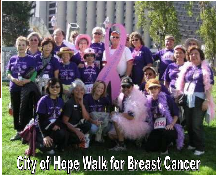
City of Hope Walk for Breast Cancer