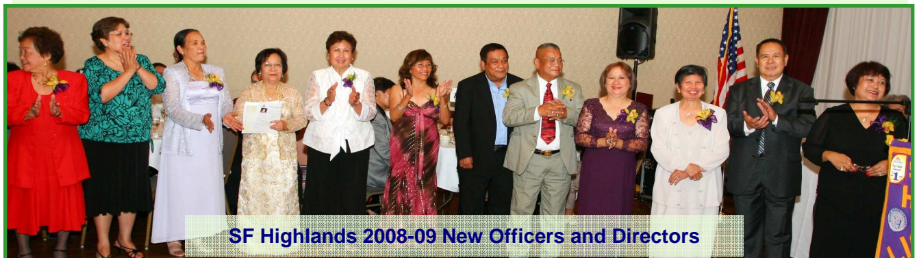
SF Highlands 2008-09 New Officers and Directors