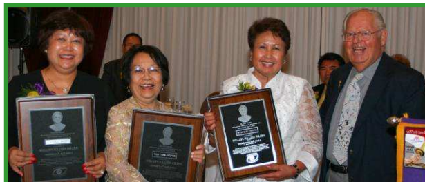
Helen Keller Fellows