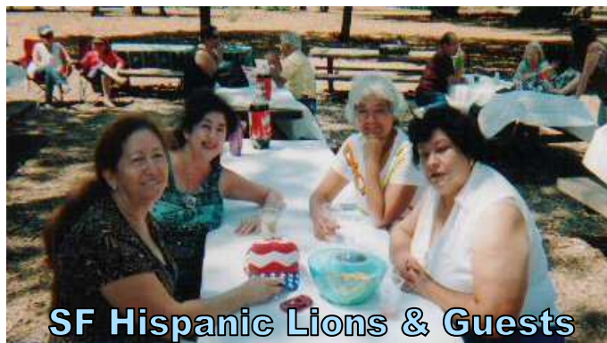
SF Hispanic Lions & Guests

Lions Clubs International traditionally observe "White Cane Days" on the second weekend of October. This year that is October 10-11, 2009.