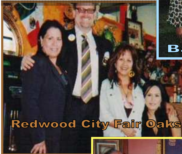
Redwood City Fair Oaks