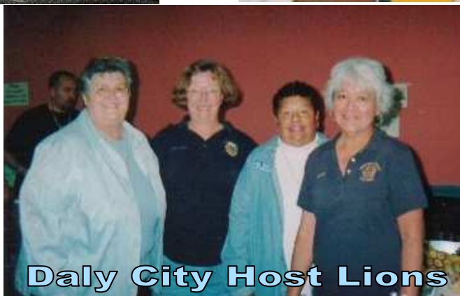
Daly City Host Lions

was so much food with adobo, pancit, rice, fish, several salads, lumpia, bbq chicken and an assortment of desserts.