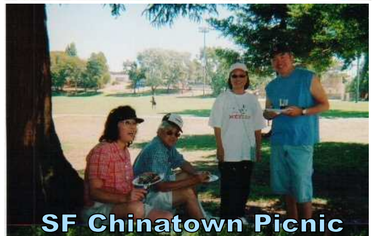
SF Chinatown Picnic