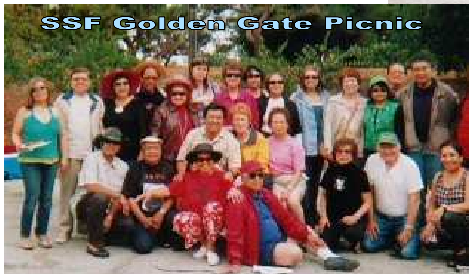
SSF Golden Gate Picnic