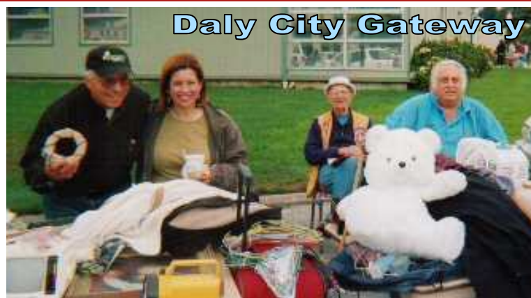
Daly City Gateway

SSF Golden Gate also on the 13th at Coyote Point hosted a members, families and friends picnic. There