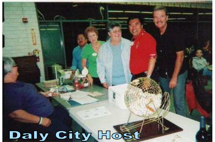
Daly City Host