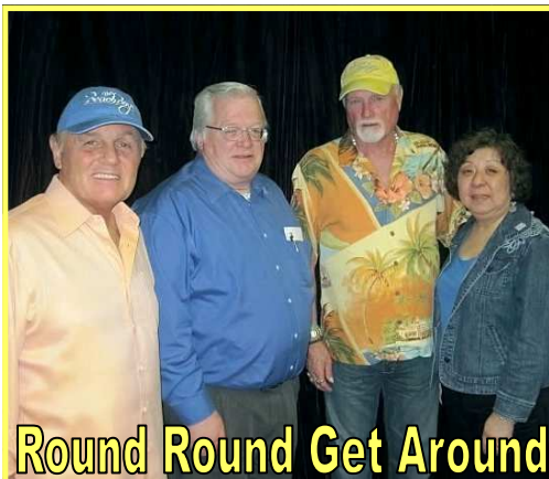
Round Round Get Around