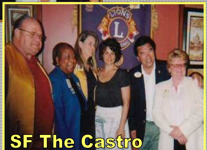
SF The Castro