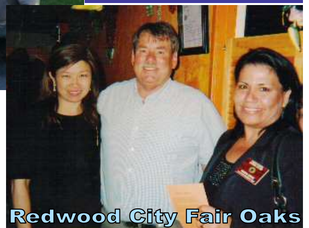
Redwood City Fair Oaks