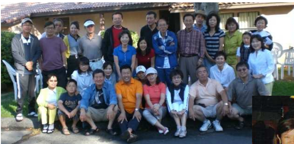
Members of SF KoAm Lions Club during a trip to Warner Springs Ranch with sister club, LA Forerunners Lions Club members on Labor Day weekend.