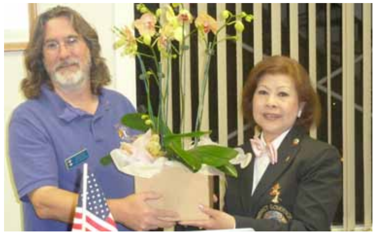
San Carlos Pres Scot and DG Esther during visistation.