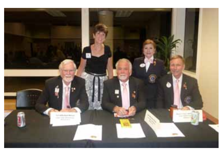
Visitation to Foster City