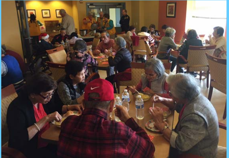
Hillcrest Gardens Residents enjoying Lunch.