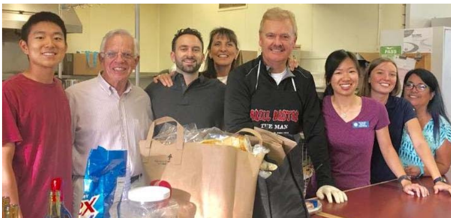
Pasta Bingo Crew!

First of all a big hurrah for the fantastic job at our Pasta Bingo event. We netted $2,500.00 on this activity. That's the best we've ever done. It is all because of the great effort of our members and volunteers. Congratulations!