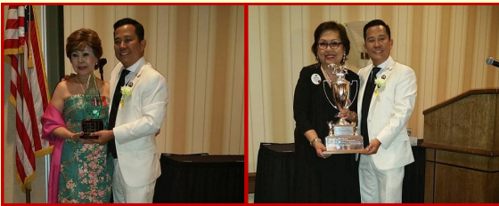
Lion of the Year & Si Moyer Award Winners

TO ENCOURAGE service-minded people to serve their community without personal financial rewards, and to encourage efficiency and promote high ethical standards in commerce, industry, professions, public works and private endeavors.