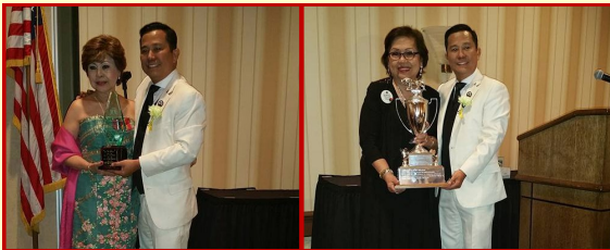
Lion of the Year & Si Moyer Award Winners

TO ENCOURAGE service-minded people to serve their community without personal financial rewards, and to encourage efficiency and promote high ethical standards in commerce, industry, professions, public works and private endeavors.