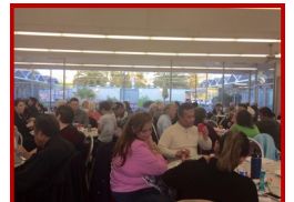
1: BASO LC Plant Night Fundraiser 2: Millbrae LC Youth Essay Contest Awards 3: District Student Speaker Contest 4: Sf Chinatown LC Teen Chinatown Charity Gala 5: Daly City Host LC Bingo Feed