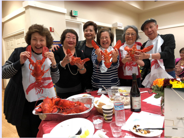
Diabetes Lobster Dinner in Foster City