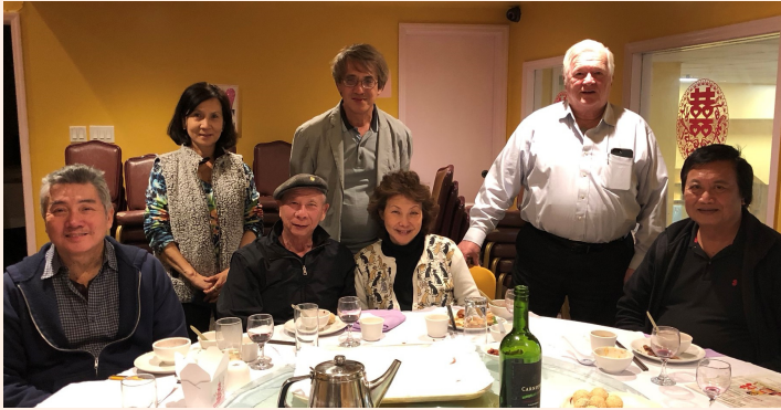
First Teen Gala Meeting