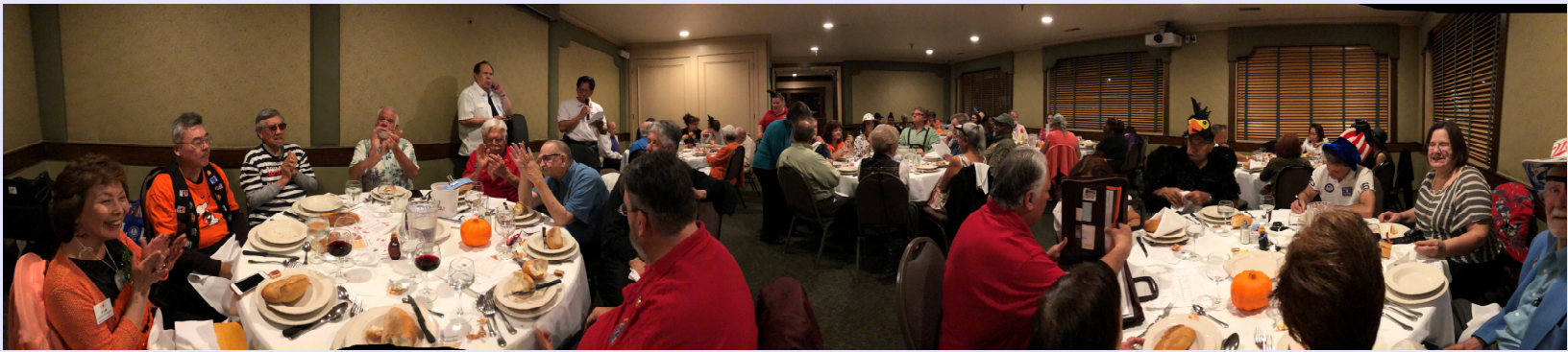
PCL & SF Joint Coordinating Council Meeting In Daly City