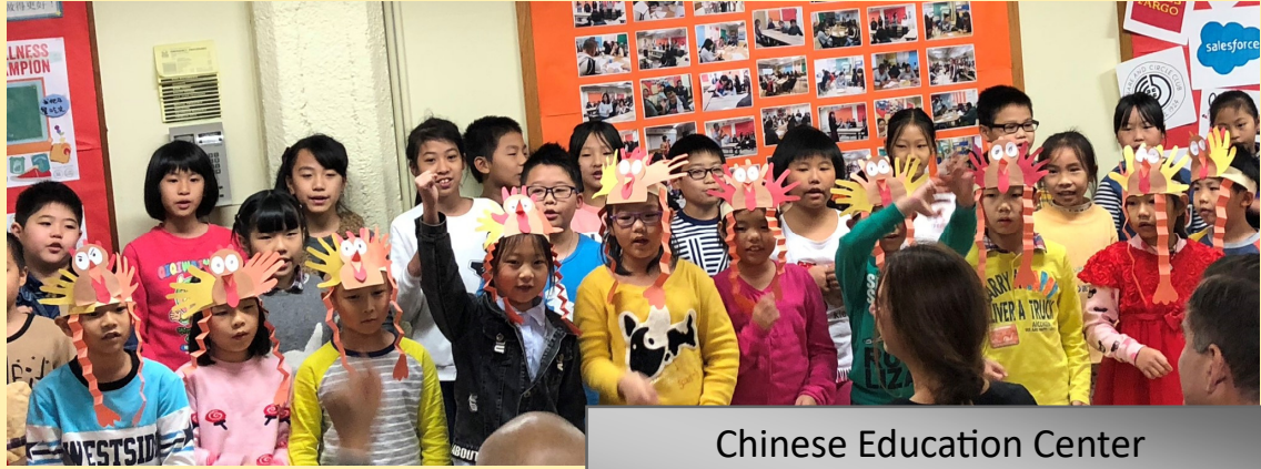
Chinese Education Center Thanks Giving First one in the U.S.A