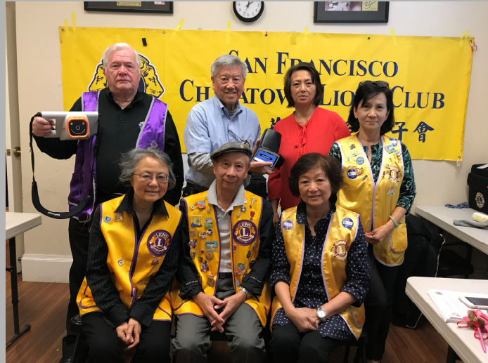
Eye Screening at Asian Woman Resource Center