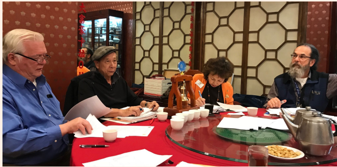
Lions Hard at Work at Board Meeting