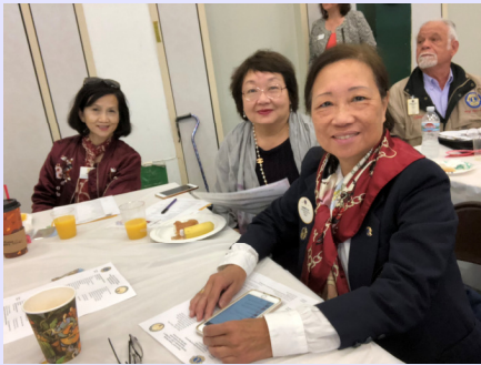
The Club got an Award For LCIF Donation