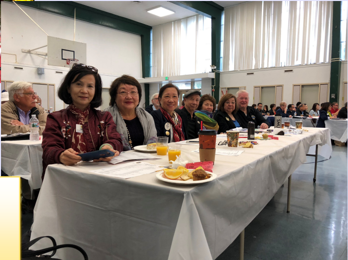
Second District Cabinet Meeting in San Bruno