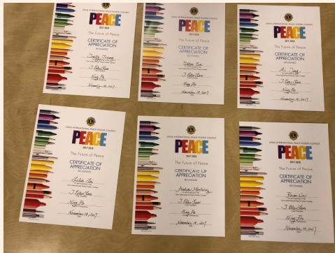
Peace Poster Certificates