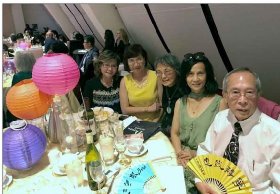
Chinese Cultural Center dinner