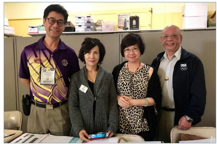
Our leadership team in training