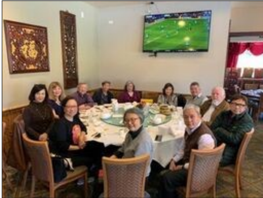
April 17th - The past presidents for the San Francisco Chinatown Lions Club gathering together as a nominating committee for next years officers.