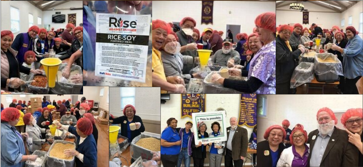
April 14 - Rise against Hunger. Preparing food packages for those in need. This was a District project to prepare over 10,000 food packages for the hungry. Each package would provide a family of six with food.