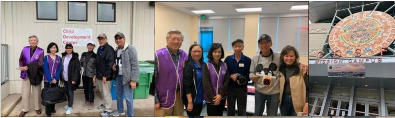
Our Club did two vision Screenings in April. The screening were at the San Francisco City Collage Ocean Campus and the Valencia Campus. Eight of the children screened were referred for an eye exam for glasses.