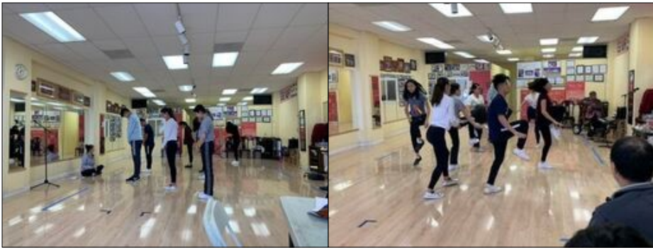
April 14th - The teens had their last rehearsal prior to the day of the teen event. They are ready and looking forward to the following Saturday.