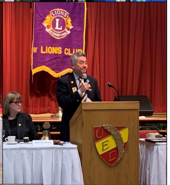
April 13 - San Francisco Council of Lions held their annual Police and Fire Awards banquet at the Patio Espanol in San Francisco. The San Francisco Chinatown Lions Club sponsored a police officer for the event. Congratulations to all for their service to our community.