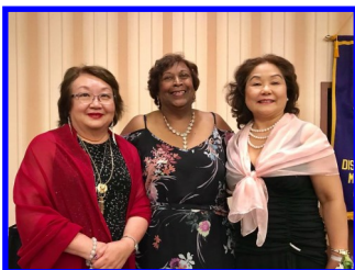
District Governor & VDGs