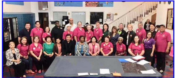
Cabinet Photos: Cabinet Uniform, District Installation, District Pink Shirt. Installation Photo by Frank Jang