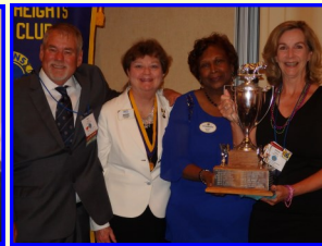
Lion of the Year & Si Moyer Award Winners