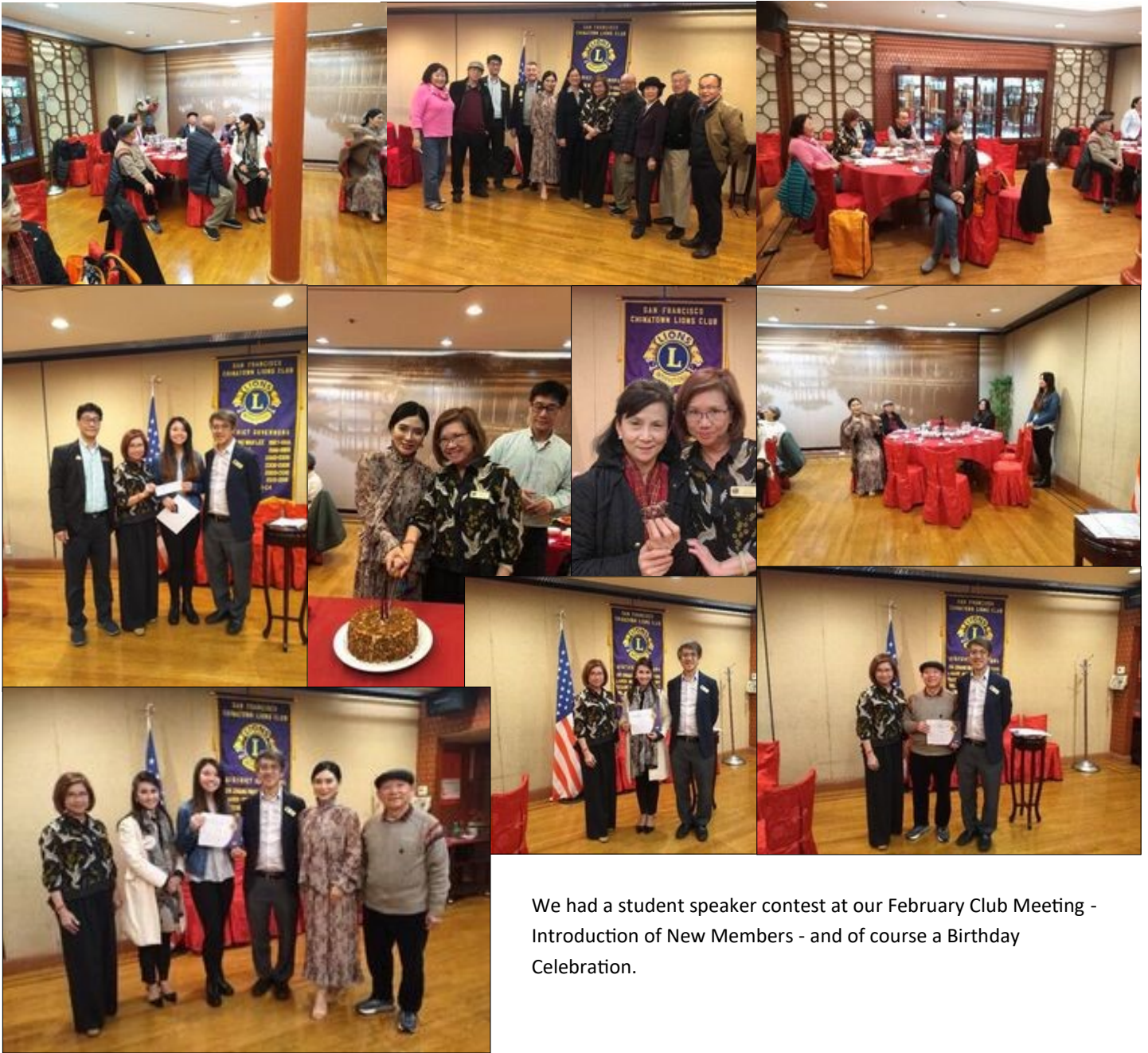
We had a student speaker contest at our February Club Meeting - Introduction of New Members - and of course a Birthday Celebration.