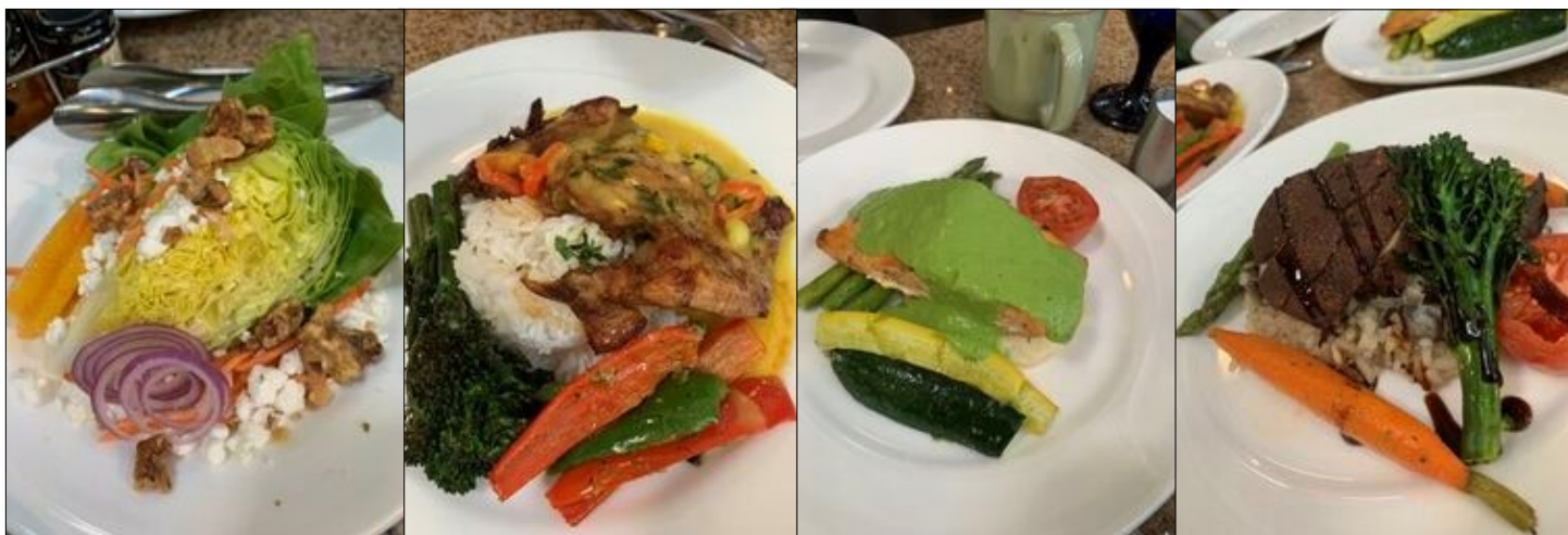
We went to taste the food for the Teen Gala at the Crowne Plaza. You will not be disappointed.

For the Salad - A Butter Lettuce Wedge with Carrots, Sliced Onions, Candied Pecans with a choice of blue cheese or a vinaigrette dressing (no blue cheese on the salad). A choice of 1) Ginger Soy Marinated Chicken Thigh with Garlic Mash Potatoes and Thai Red Curry. 2) Pan Seared Salmon with Mashed Potatoes or 3) Portobello Mushroom & Roma Tomatoes with a Balsamic Reduction over Risotto. All three will have Seasoned Vegetables. And of course a dessert. I thought all three were very good - Even the vegan plate.