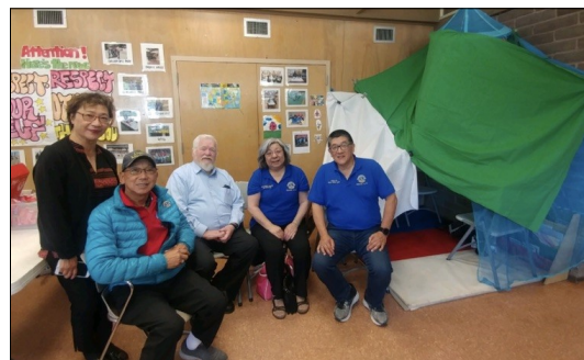
Vision Screening for Wu Yee Children's Services