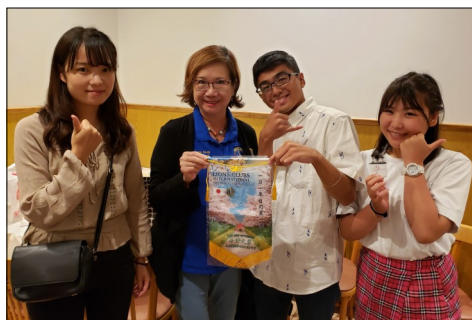
Exchange Students From Japan