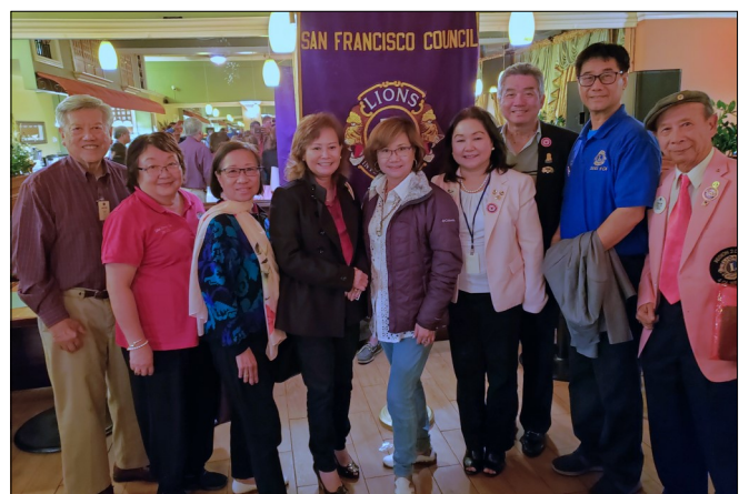
R. San Francisco Council of Lions