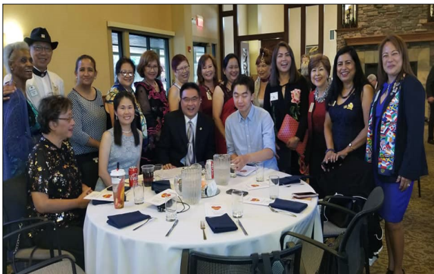
Walnut Creek Installation