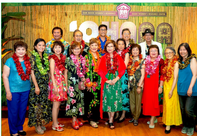
L. Gum Moon/Asian Women Resouce Center