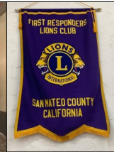
Visitation to the First Responders Lions Club at the 16 Mile House in Millbrae.