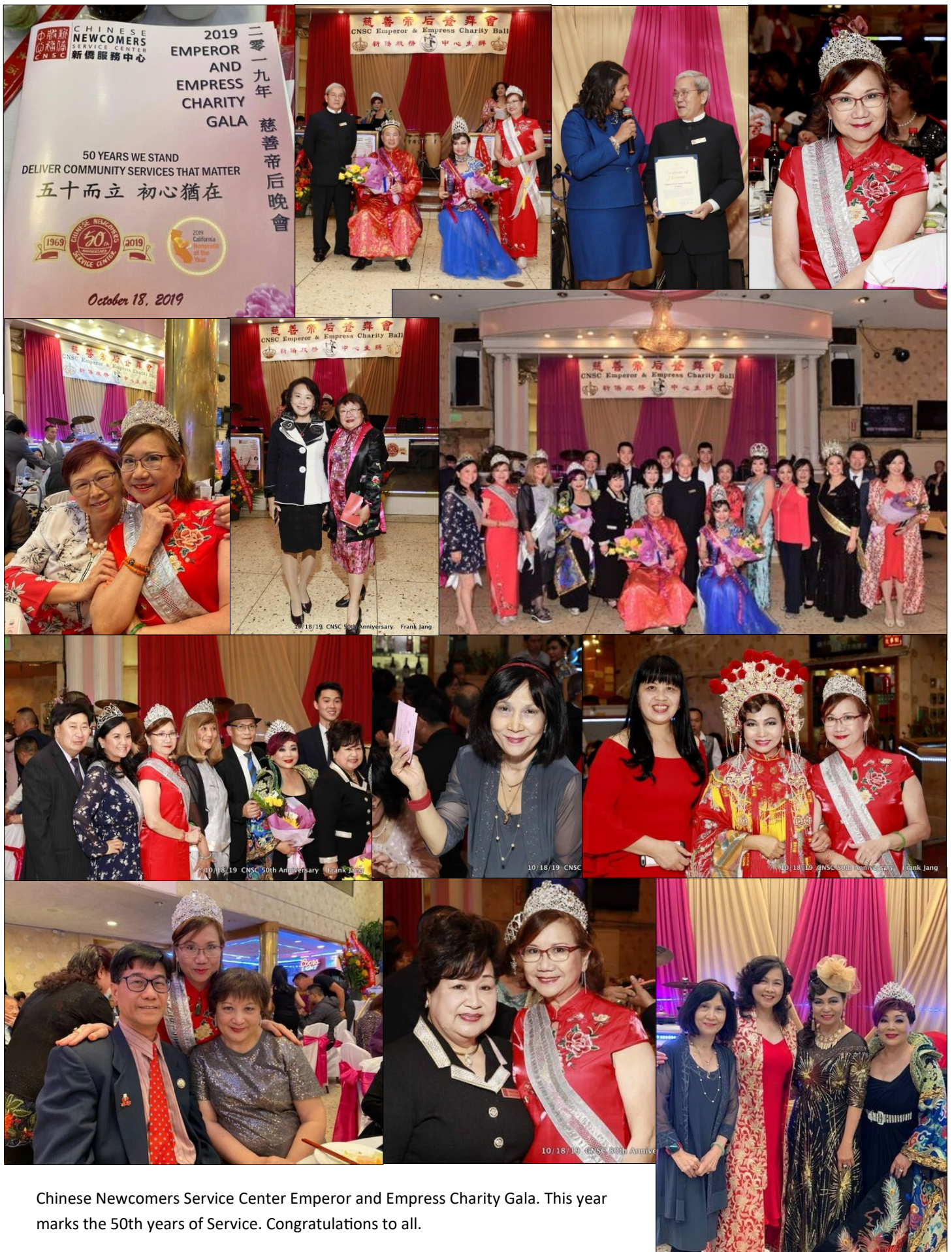
Chinese Newcomers Service Center Emperor and Empress Charity Gala. This year marks the 50th years of Service. Congratulations to all.