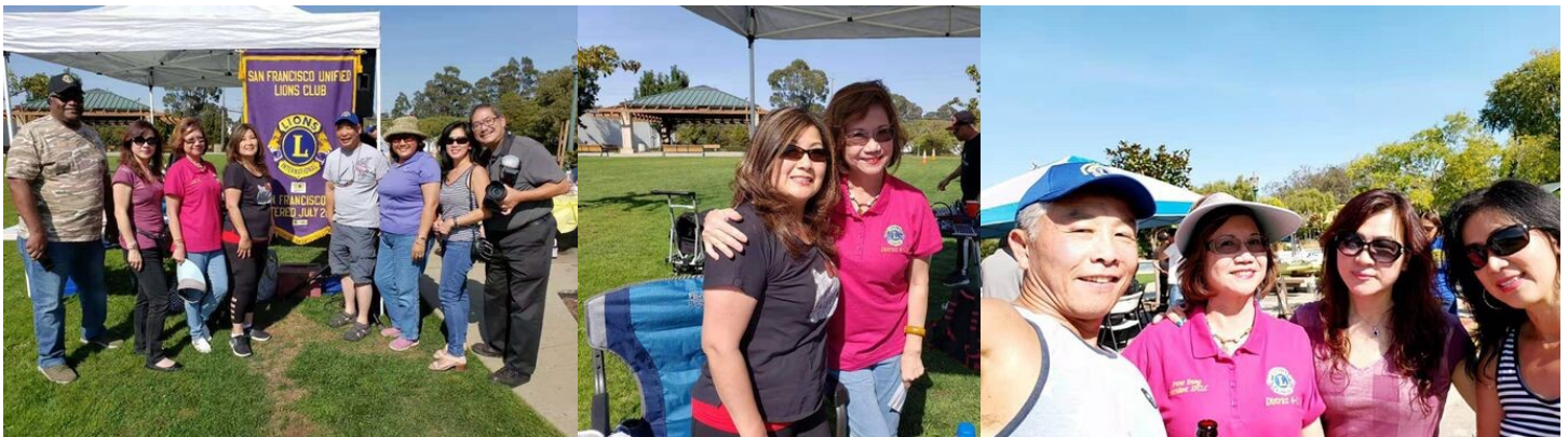
The San Francisco Unified Lions Club picnic held in San Bruno