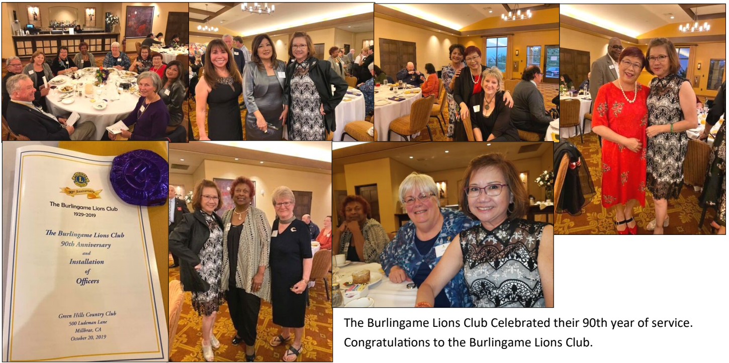
The Burlingame Lions Club Celebrated their 90th year of service. Congratulations to the Burlingame Lions Club.