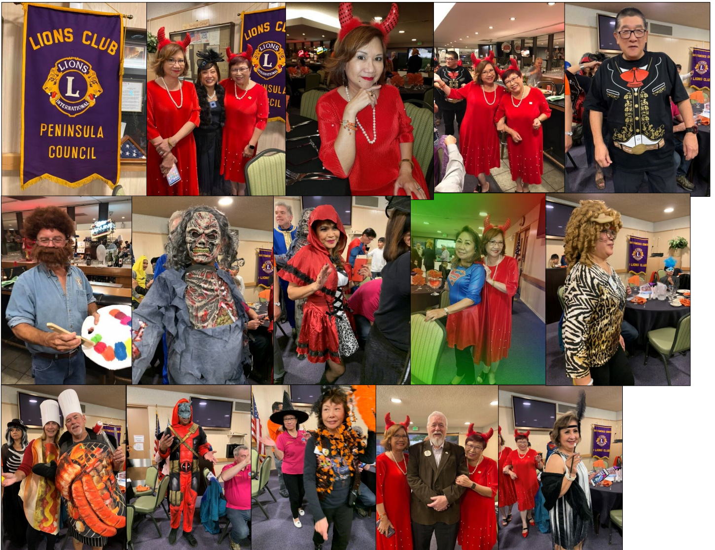
The Peninsula Council and San Francisco Council have a joint meeting in October. Fun was had by all.