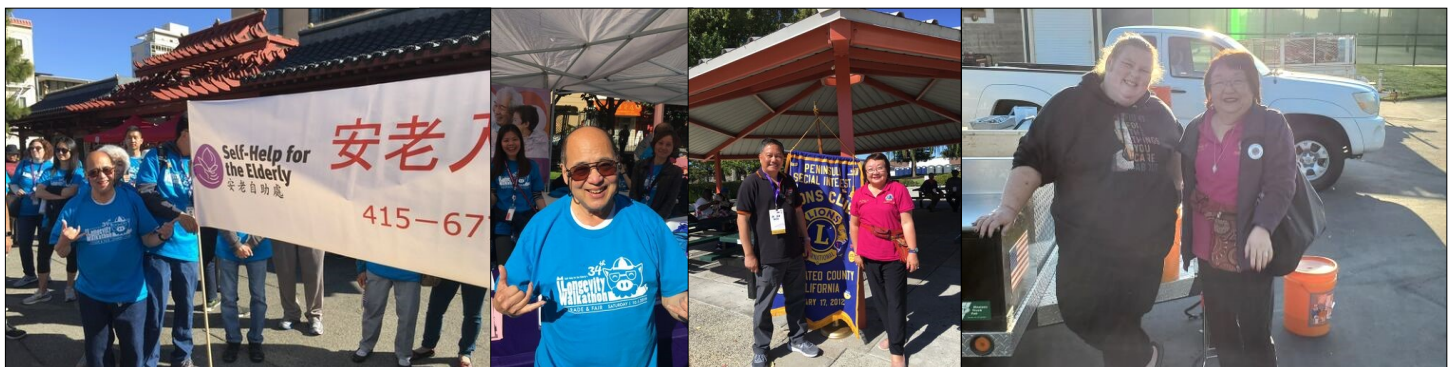
Self Help for the Elderly Walk-a-thon and Stand Down, both on October 5th