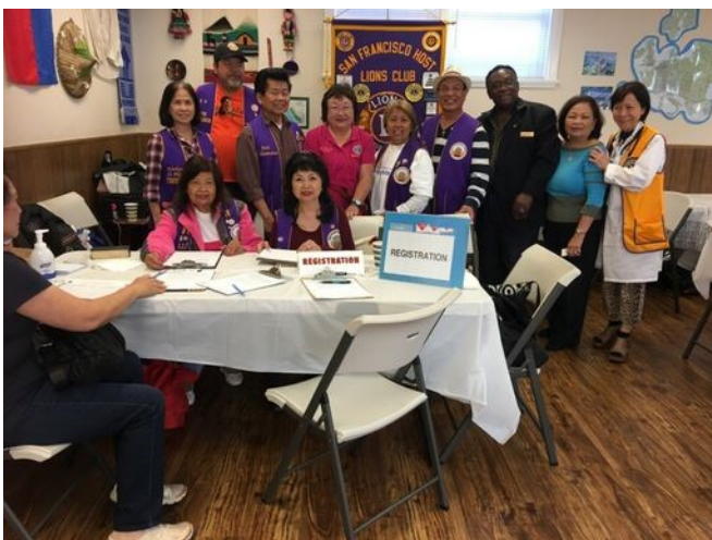
The registration desk for the District 4-C4 Disaster Preparedness Class.