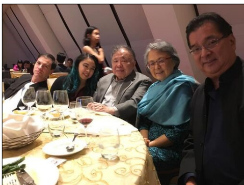
The Chinese Cultural Center dinner was held on Oct 5th. The theme was "Harmony and Bliss".