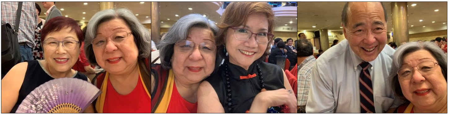
Double 10 Day Celebration at Asia Garden in Chinatown.