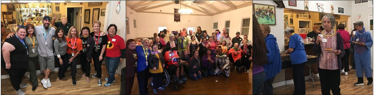
Visitation at the BASO Lions Club in Burlingame.