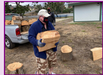
Top: San Bruno Lions conducting vision screening for John Muir Elementary students Bottom: San Bruno Lions delivering tree stumps to Portola Elementary School for their Outdoor Learning Space