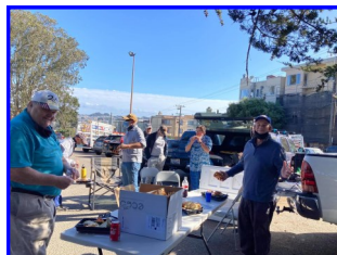
1: DG Outdoor Visit to SF Unified Lions 2: Joint Council Halloween Meeting 3: Foster City Lions Virtual Bingo & Raffle 4: BAGO & FC Bair Island Cyber Halloween Festival Service 5: Burlingame Lions Thanksgiving Luncheon 6: SF Unified & Veterans Lions Bikes 4 Vets event 7: San Mateo Lions Dining Club Fundraiser 8: Lions Veterans Charities annual golf & lunch project with outpatients from SF Veteran Administration 9: San Bruno Lions Covid Vision Screening 10: Silicon Valley Cyber Lions at UN 75th Anniversary SF