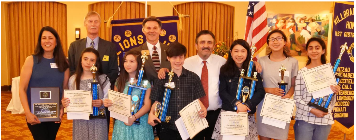
2019 Winners: Millbrae Lions Club Youth Week "Student Essay Contest" and "Educator of the Year Award"