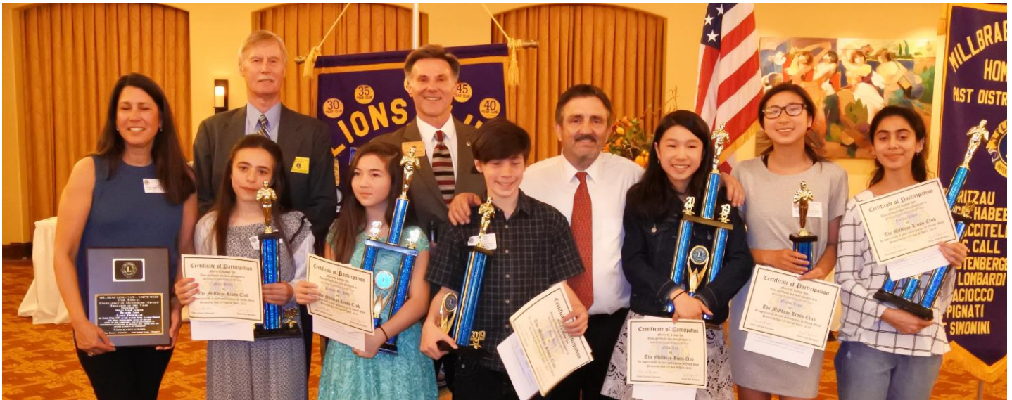
2019 Winners: Millbrae Lions Club Youth Week “Student Essay Contest” and “Educator of the Year Award”