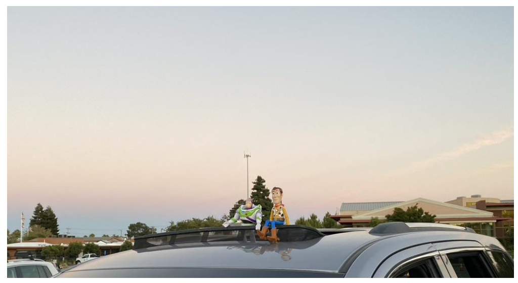
Photo from last MLC Drive-in on August 14, 2020 where many families came to watch Toy Story 4 complete with Woody and Buzz Lightyear