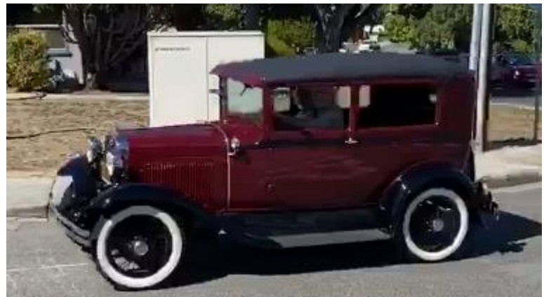
Some pictures from the car parade on September 26, 2020