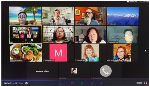
Teen Meeting with production to discuss program