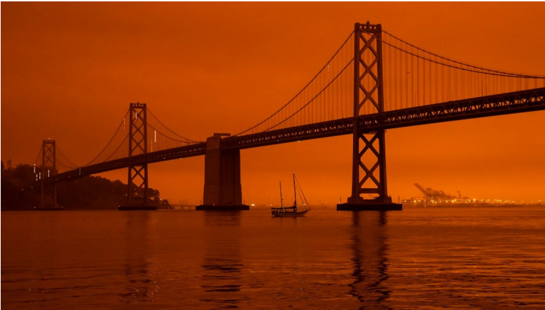
Afternoon Darkness and Orange Skies