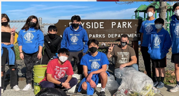
Bayside Manor Park Clean-Up