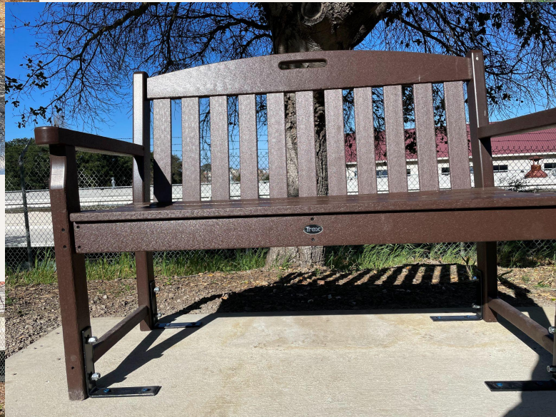
Bench #1, located on Spur Trail above the Caroline Shea Center (@ Taylor Middle School).