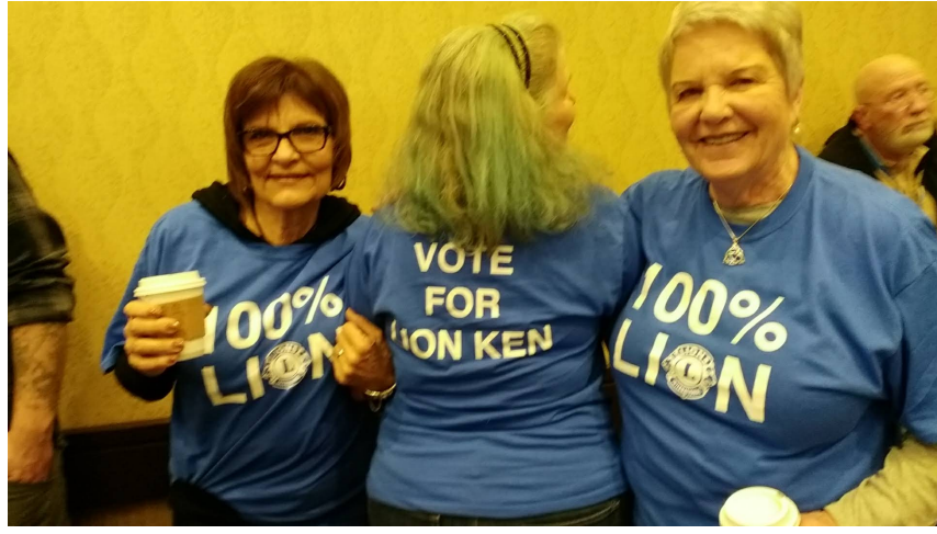
Millbrae Lions Club | P.O. Box 328, Millbrae, CA 94030 https://www.millbraelions.club/