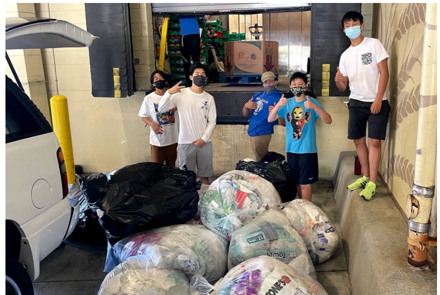
Millbrae Lions Club | P.O. Box 328, Millbrae, CA 94030 https://www.millbraelions.club/