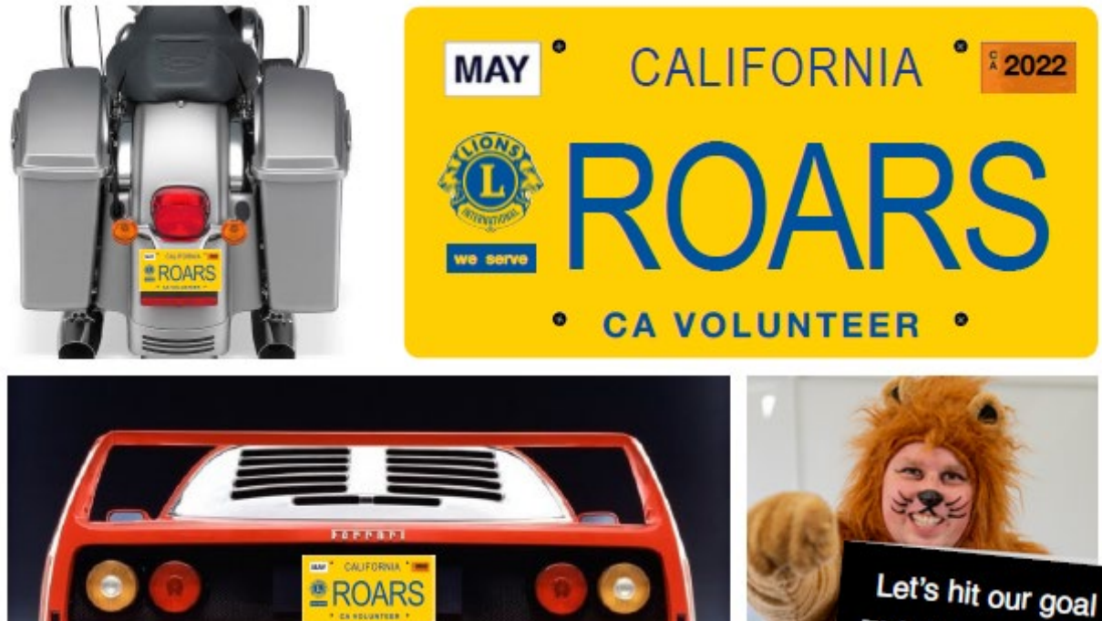
7500 license plate and moving billboards