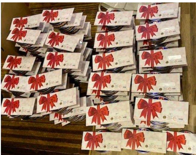
@ Green Hills Elementary (right)

Over 240 families and community members benefited from our highly impactful program. Special shout out to Lady Tiffany Noelle for helping put together the 125 gift packages! She is AMAZING!