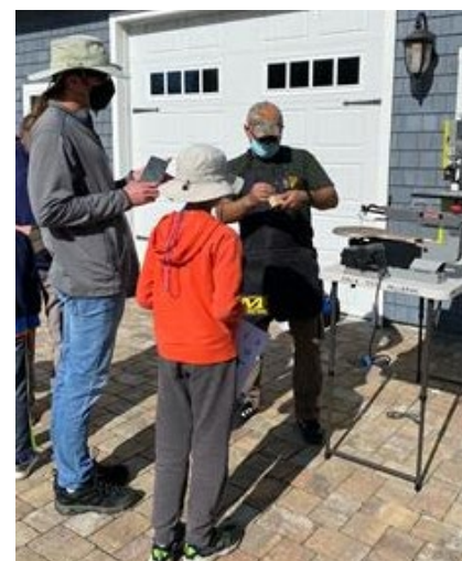
Above: 'pre-work' being done at the 3/5/22 PWD 'Build Workshop'