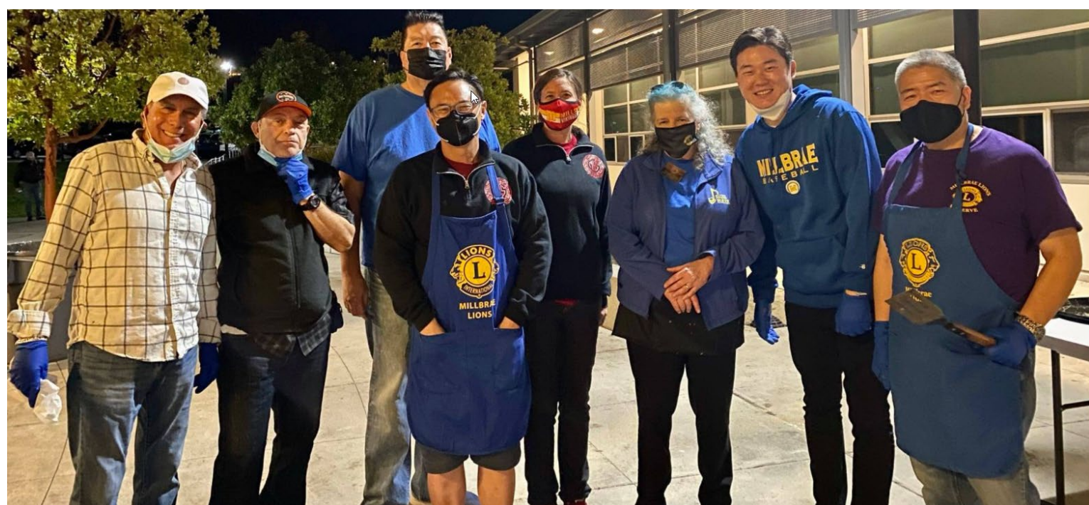
Millbrae Lions Club | P.O. Box 328, Millbrae, CA 94030 https://www.millbraelions.club/