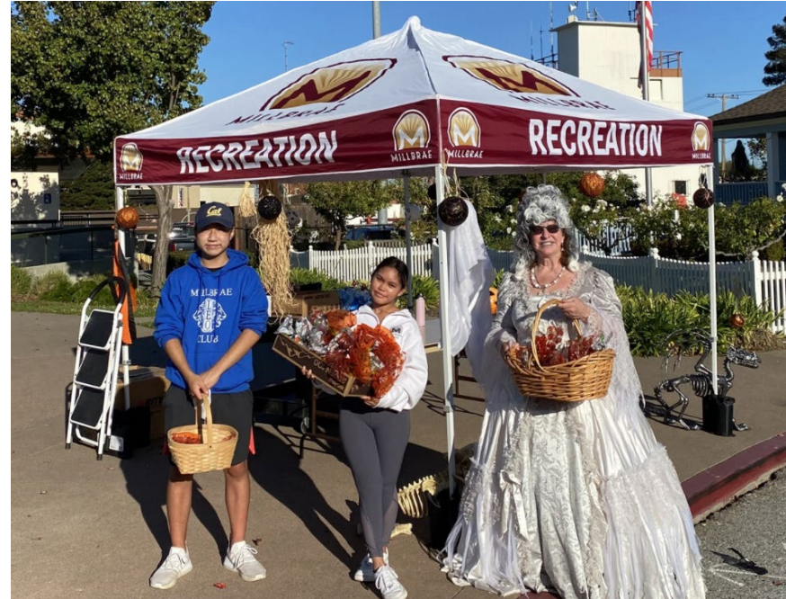
Lions Candy-Giveaway on 10/29, right

Mills HS 'Groove-a-Thon' music event, above; Mills + Lions Grilling lessons, left