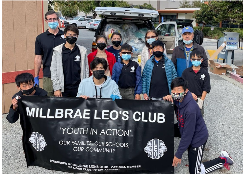
Let's Go Millbrae LEO's/Millbrae MOJO!

Millbrae LEO's met up with the Millbrae Scouts Troop 355 on SpookySunday (Halloween) afternoon @ Millbrae Rec Ctr (City Hall) – and processed ANOTHER 200+ pounds of recyclable plastic!! We are approaching 4,000 pounds of plastic being kept out of landfill and recycled into outdoor benches (8) for Millbrae! The plan is to have an installation ceremony in December for the first few benches, the sites have been selected and the concrete footings will be poured soon... WATCH THIS SPACE!