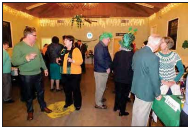
Burlingame Lions St. Patrick's Day Dinner