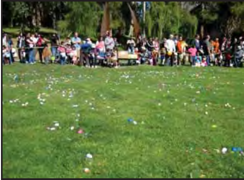
March 23 San Bruno Lions Club Easter Egg hunt and Pancake Breakfast