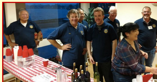
Bar Crew at Foster City Lions Club White Cane Bingo Feed