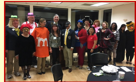
DG Visitation to Foster City Lions Club Halloween Meeting