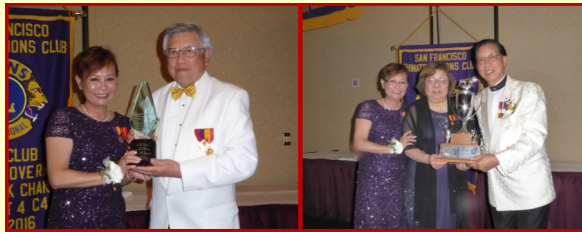
Lion of the Year & Si Moyer Award Winners

TO ENCOURAGE service-minded people to serve their community without personal financial rewards, and to encourage efficiency and promote high ethical standards in commerce, industry, professions, public works and private endeavors.