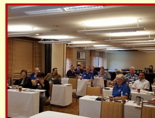
VDG Training at MD4 COG