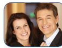
Dr. Mehmet Oz & Lisa Oz

Grace the Lives of Children & Those Who Care for Them!